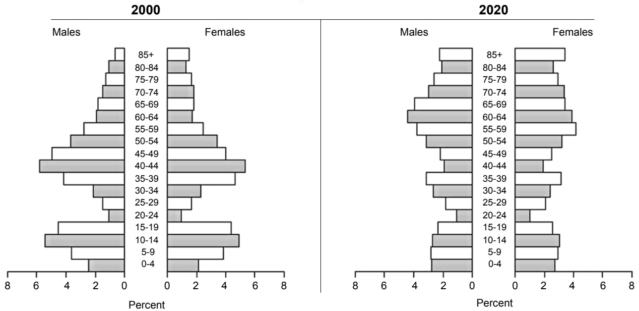
Table 2. Population Projections by Age and Gender, 2005, 2010, 2015, and 2020: Mercer County