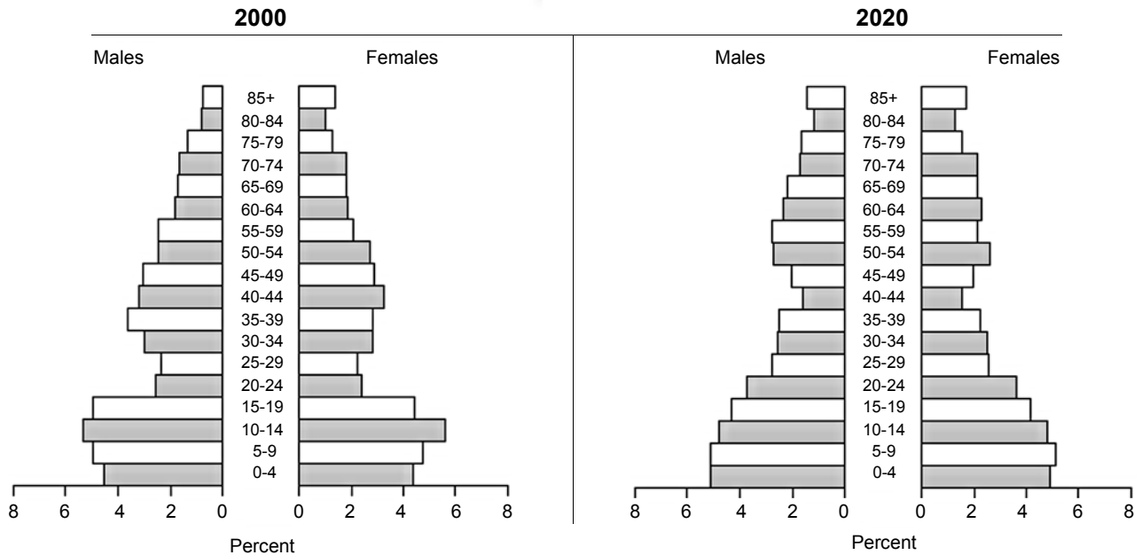
Table 2. Population Projections by Age and Gender, 2005, 2010, 2015, and 2020: Benson County