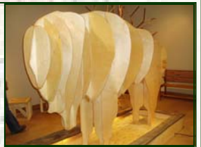
Life-size bison built by students

It's been said that, only God can make a tree. Our Third year students built an entire landscape.